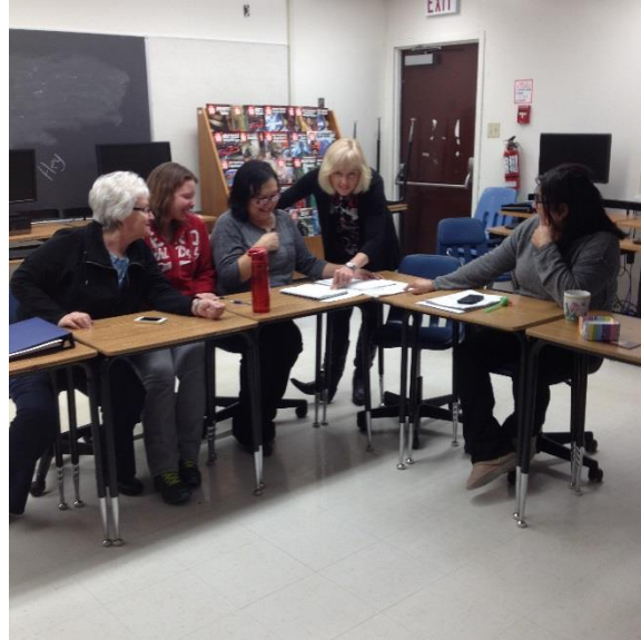
On January 23, 2015, staff at Paddle Prairie School hosted a session to work on prioritizing the curriculum