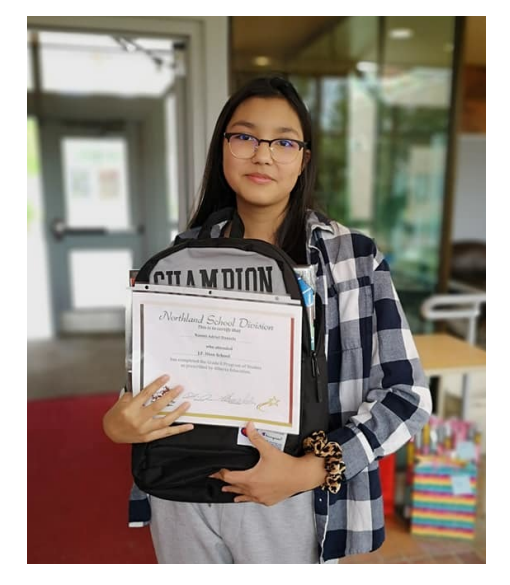
J.F. Dion School celebrating grade 8 graduates. Grade 8 students move onto high school in communities such as Cold Lake and Bonnyville.