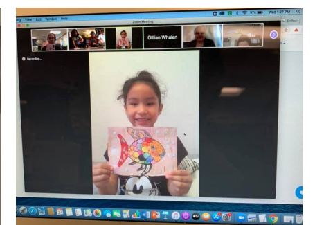
Conklin Community School students read Rainbow Fish and worked on a craft together via Zoom!