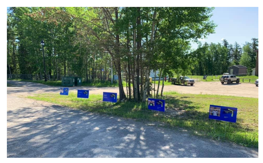
Check out the signs made to honour graduates in Conklin!