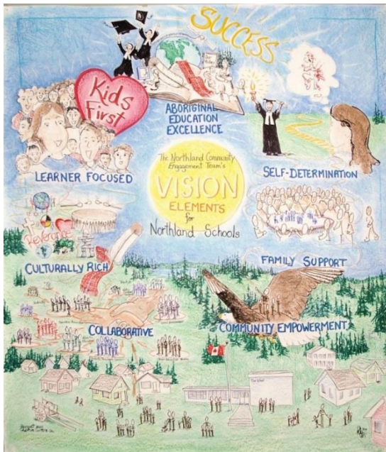
Figure 1: Vision Elements