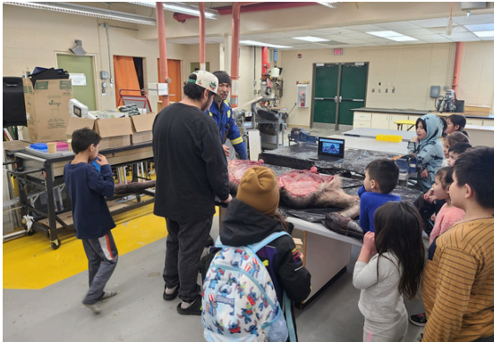
Students from Father R. Perin School (in-person) and Northland Online School (virtually) took part in a hands-on moose processing lesson. The students learned about hide removal, meat cuts, and edible parts, gaining valuable cultural knowledge.

Northland schools are committed to teaching from the land and weaving Indigenous languages into learning experiences. Students across NSD engage in land-based activities such as fishing, trapping, and harvesting medicines, which are woven into core subjects like math, science, and social studies. Indigenous languages such as Cree, Dene, and Michif, are being integrated into classroom learning. Elders and Knowledge Keepers visit schools to share stories and teachings, helping students learn the language while deepening their connection to culture.