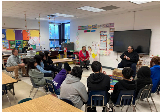
Elders visited St. Theresa School to educate students on the history of drumming and the tea dance.