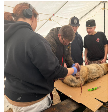
Bill Woodward School students in Anzac took part in a land camp, where they were introduced to trapping and traditional hide preparation. They had a hands-on experience skinning a coyote, scraping the hide, and preparing it for stretching—gaining insight into skills used in the fur trade.