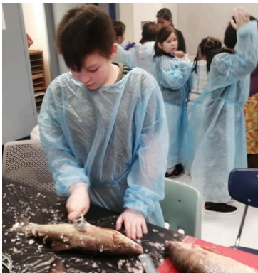
Each year, Calling Lake School partners with Elders and local community members to provide students with a hands-on ice fishing experience. Students learn how to set and retrieve the net, clean the fish, and gain valuable traditional knowledge.

Northland schools are committed to teaching from the land and weaving Indigenous languages into learning experiences. Students across NSD engage in land-based activities such as fishing, trapping, and harvesting medicines, which are woven into core subjects like math, science, and social studies. Indigenous languages such as Cree, Dene, and Michif, are being integrated into classroom learning. Elders and Knowledge Keepers visit schools to share stories and teachings, helping students learn the language while deepening their connection to culture.